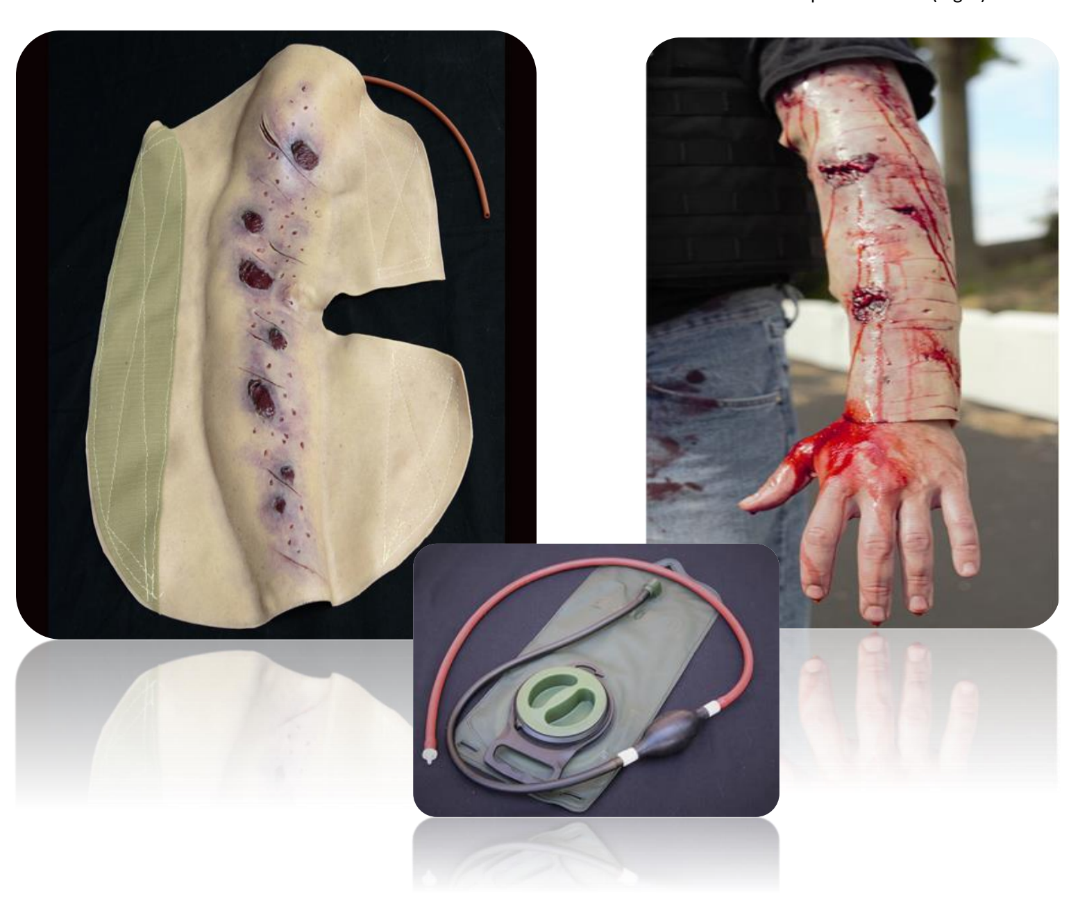
WW3-054 Shrapnel – Full Arm (Right)

Techline Technologies, Inc. Device Specifications WW3-054 Shrapnel -Full Arm (Right)