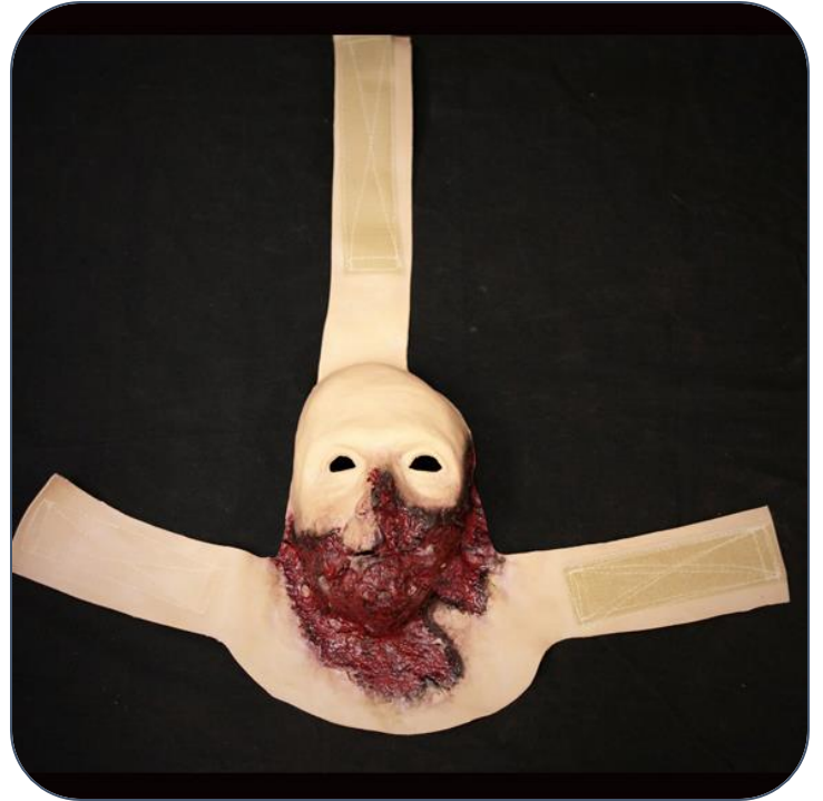
WW3-011 Burned Face – Full Mask